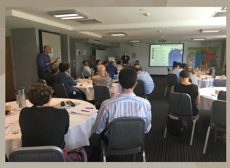
Attendees at the February Joint Investigator Stakeholder meeting

The second part of the morning program covered the models of care framework, the type of data received so far and an early sample of analysis. There was animated discussion of the five distinct models of dialysis care selected to provide a framework for the research.