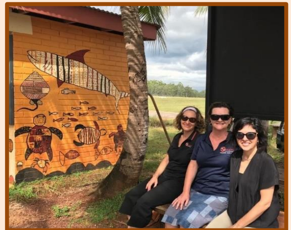
Milikapiti departure lounge