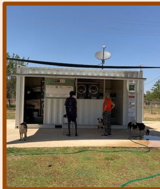
The laundry is situated next to the community shop