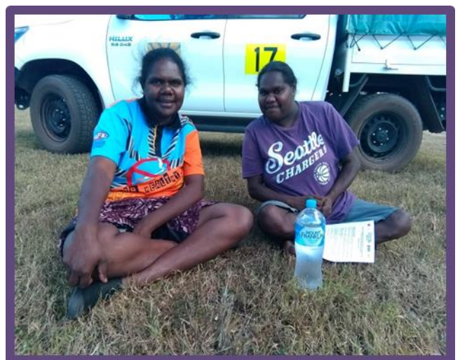
Two mothers talking about ARF