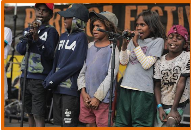
Barunga children singing their song Boom Boom on stage at the Barunga Festival in June

Strong and ongoing links have been established with school, housing, other community groups. A song and video about the early detection and management of skin sores and sore throats has been produced by the children of Barunga