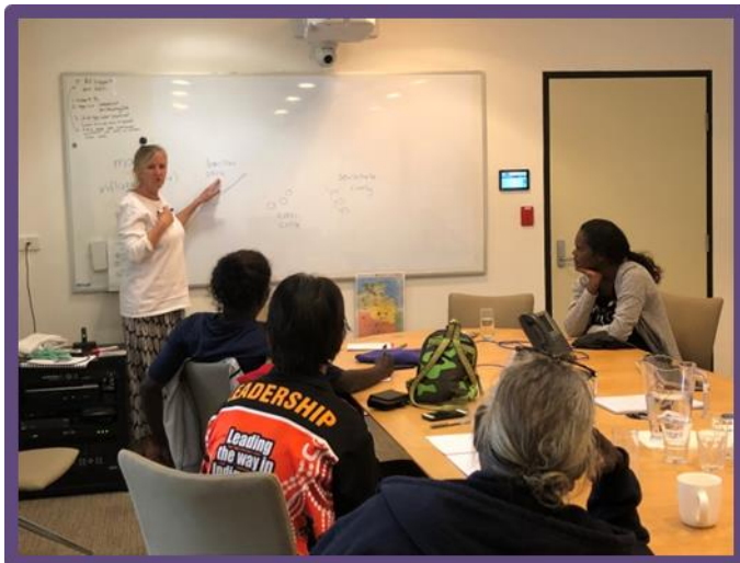
ACWs learn about Strep A

24 households are participating at the moment. Over 600 household interactions have occurred. 27 skin sores and sore throats have been self-reported. Analysis of the first year of implementation is forthcoming.