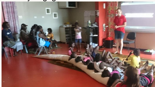
The screening of the Take Heart Movie

The RHD SP project team worked with the Julanimawu Health Clinic, Bupa and Moonshine Productions to organise a launch of the Take Heart movie at the Tiwi Football Grand Final in March. Approximately 60 people including visiting medical staff, clinic staff and people affected by ARF/RHD attended the launch on the morning of the Grand Final. The movie was well received. After the screening, the project team set up a health promotion stall at the footy grounds, and delivered messages about ARF prevention. The project team invited children to put their 'Hands Up for A Healthy Heart' – which involved getting messy with red paint! It was also a great activity to teach children about handwashing. In the evening the clinic hosted a community BBQ, and screened the Take Heart Short Films to an audience of children and football players. The audience was very engaged.