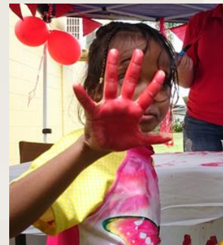
'Hands up for a Healthy Heart'