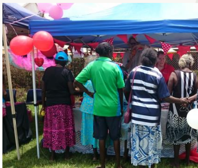
The health promotion stall