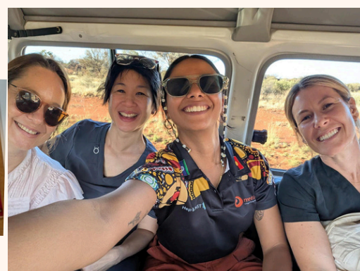
clinical team - trip to Yuendumu