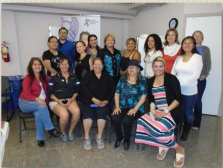
Group photo - June 2014 Training Workshops