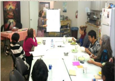
Healthy Kitchen participants enjoying the meal they prepared at the ACCP.